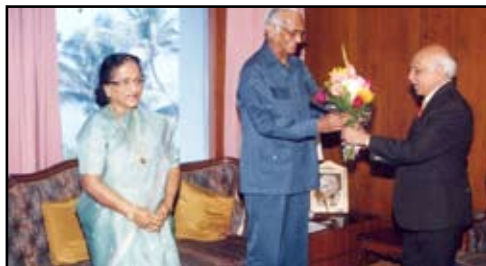
Honored by His Excellency Dr. P.C. Alexander The Governor of Maharashtra 1996