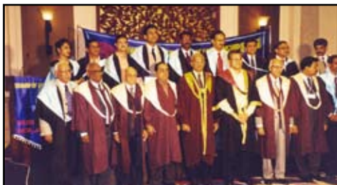
Convocation Ceremony at Hotel Grand Maratha Sheraton