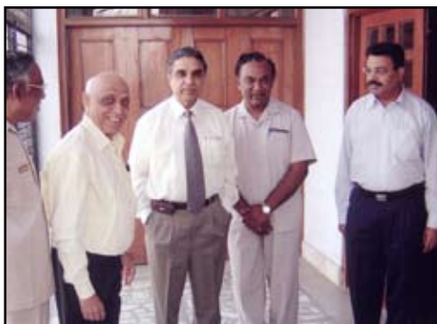
Faculty at Workshop